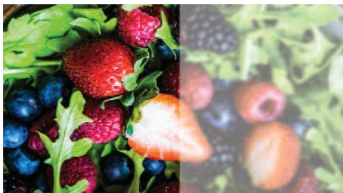
Viewed through material with low haze